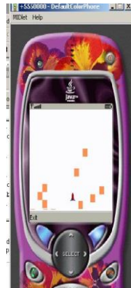
Figure 1: Emulator running the example game app during development

It is easy to build games in the emulator and test them. The figure below shows a sample game that is running in the emulator.